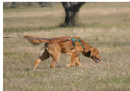
Sue Jackson's "Kodi" looking for an article at HOT's December TDX Test